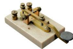
A straight key originally designed and built by Hiram Percy Maxim, W1AW, ARRL's first president and cofounder. The key was provided courtesy of the Antique Wireless Association.

Entries must include the actual key (it will be returned following judging), as well as detailed drawings, photos, and a written narrative. Winners will be chosen based on ingenuity of design, ergonomics of operation, and overall craftsmanship. The judges' decisions are final.