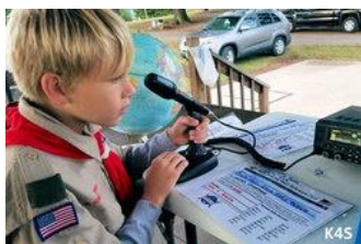
Special Event station K4S in Jasper, Tennessee, where members of Scout Troop 5 and Cub Scout Pack 3005 participated in JOTA.

"Looking over the numbers, a big part of the increase in JOTA Scout participation came from the World JOTA-JOTI (Jamboree on the Internet) Team's registration and reporting system," Wilson told ARRL. "We had 233 stations report results on the US system, which is comparable to last year's 226. In addition to that, 90 stations reported their results on the World system. After eliminating duplicates, this added 33 to our total of 266 station reports. That, chiefly, accounts for the increase in total Scout participation. In summary, perhaps this nice increase is due primarily to more accurate reporting."