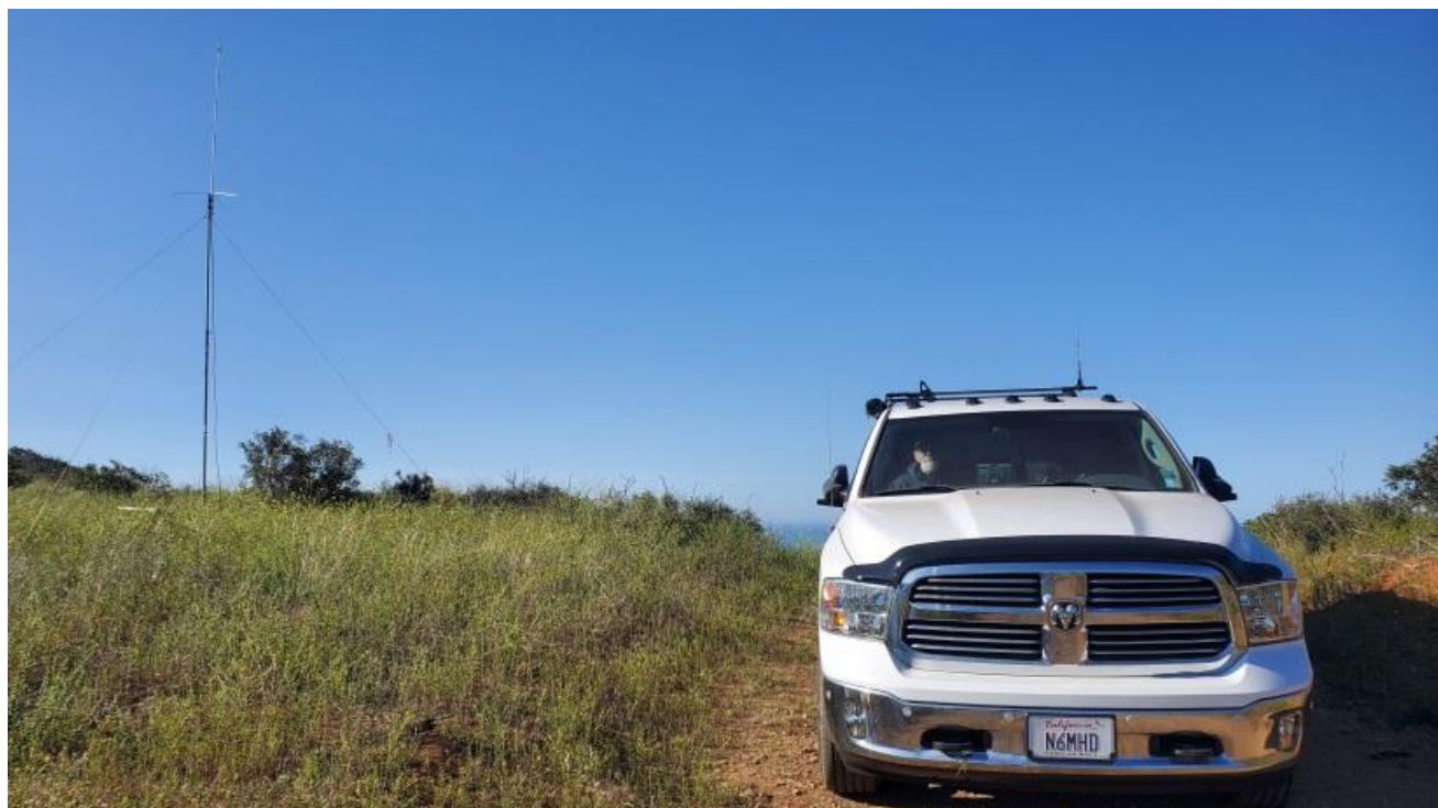
Below, the view as Michael, N6MHD and Howard, KE6MAK left the repeater site. The antenna can be seen on the left.

The 100 watt solar panel is serving two functions. It is charging the three 100 Amp-Hours batteries that are in the shade under the panel. The Radio is also under the panel, keeping cool in the heat of the day.