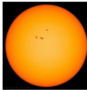
Solar disk image taken November 10, 2022

Because ARRL is closed this Friday for Veterans Day, the regular Friday bulletin will not come out until Monday, November 14.