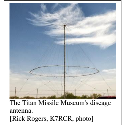
The Titan Missile Museum's discage antenna.

al military command authorities during alerts and was just one of several communications systems on the site. The antenna is still functioning, with virtually no maintenance performed since 1982, when the site went off alert. A cable runs from the